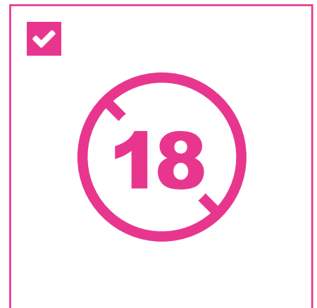
Over the age of 18